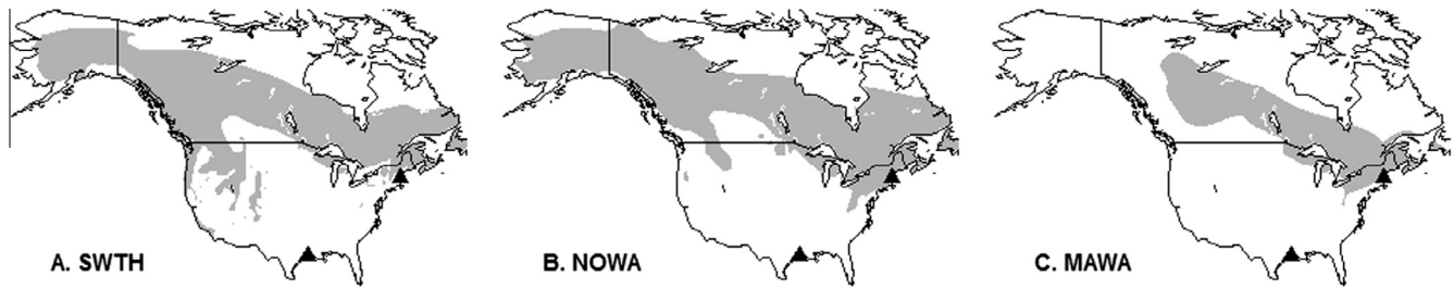
Fig. 1. Breeding ranges for (A) Swainson's Thrushes, (B) Northern Waterthrushes, and (C) Magnolia Warblers. Sampling locations in Louisiana and Maine are indicated by filled triangles. Breeding range data were provided by BirdLife-International and NatureServe (2014).